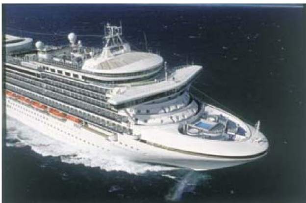
The Grand Princess under way.